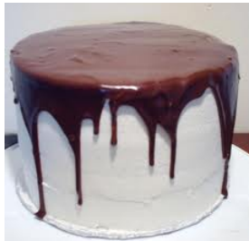
Tuxedo Cake $4.99

Dark chocolate cake with chocolate mousse filling and Rich chocolate ganache icing