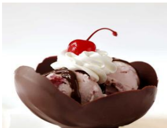
Chocolate Bowl Ice Cream Sundae $5.99