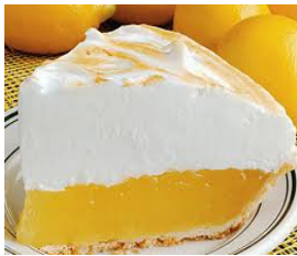
Lemon Merengue Pie $2.99