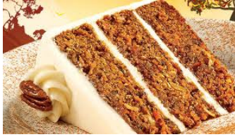
Carrot Cake $4.99

"Slices So Large that you can have your cake and eat it too"