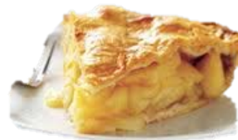
Apple Pie $2.99