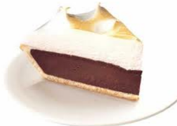
Chocolate Merengue Pie $2.99