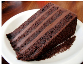
Chocolate Extreme Cake $4.99

Baker's favorite Family recipe with cream cheese icing