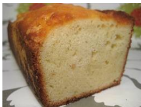
Southern Pound Cake $3.99

Classic dark chocolate cake with white-chocolate cream cheese filling, Iced with white-chocolate icing and topped with chocolate ganache oozing over the edge