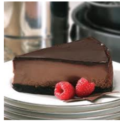
Chocolate Cheesecake $4.99